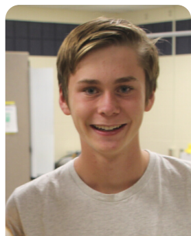
Hjalmar Rusck Sweden